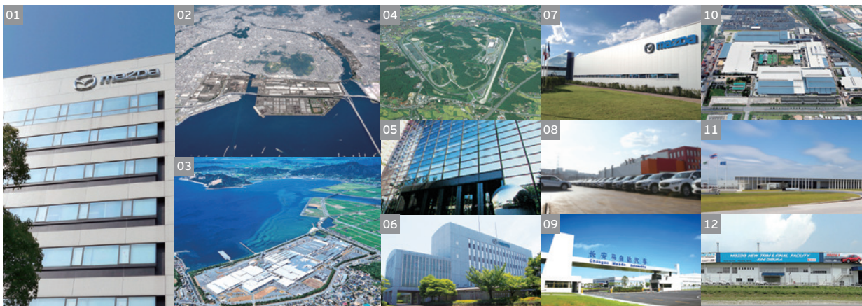
01. Head Office 02. Hiroshima Plant 03. Hofu Plant 04. Miyoshi Plant 05. Tokyo Office 06. Mazda R&D Center Yokohama 07. Mexico 08. Russia 09. China 10. 11. Thailand 12. Malaysia

■ For more details about major facilities, see Annual Report 2017 (see pp. 22-23). http://www.mazda.com/en/investors/library/annual/