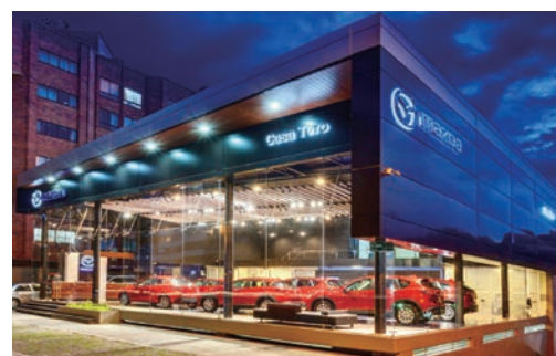
A new-generation dealership in downtown Bogotá, the capital of Colombia