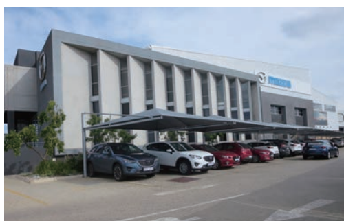
Head Office of Mazda Southern Africa