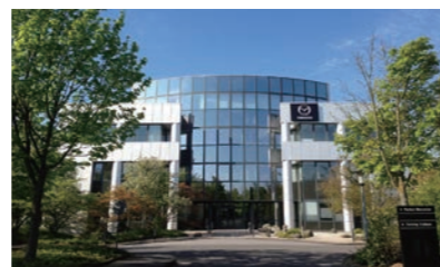
Mazda Motor Europe GmbH (MME)

1 The overseas production figures represent Mazda brand units coming off the production line (CKD units excluded).