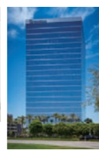
Mazda North American Operations (MNAO)