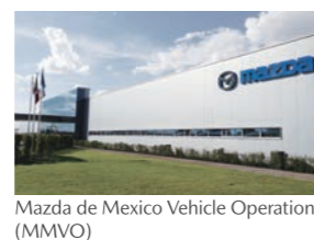
Mazda de Mexico Vehicle Operation (MMVO)

*Mazda North American Operations (MNAO) is a generic organizational name which comprises Mazda Motor of America, Inc. and Mazda Motor de Mexico S. de R. L. de C. V.