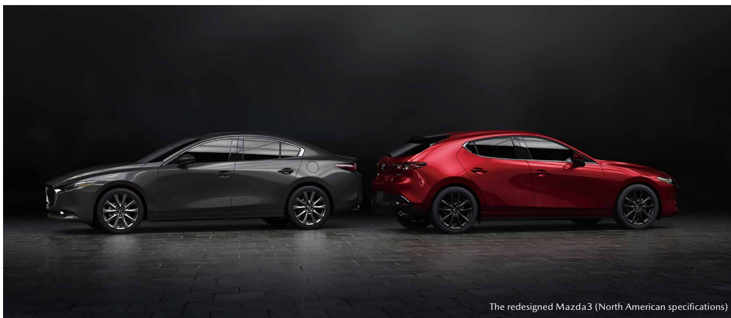
The redesigned Mazda3 (North American specifications)

The world premiere of the all-new Mazda3 took place at the Los Angeles Auto Show, held from November 30 through December 9 last year.