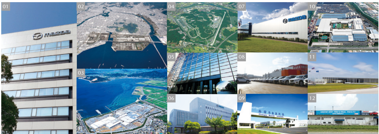
01. Head Office 02. Hiroshima Plant 03. Hofu Plant 04. Miyoshi Plant 05. Tokyo Office 06. Mazda R&D Center Yokohama 07. Mexico 08. Russia 09. China 10.11. Thailand 12. Malaysia

■ For more details about major facilities, see Annual Report 2018 (see pp. 4-5). http://www.mazda.com/en/investors/library/annual/