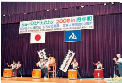
Human Rights Festival (held November 2008 with the local Fuchu Town government)

Mazda is also involved in holding a Human Rights Festival, participating in symposia, and sending speakers to give lectures or seminars, in order to convey the message of respect for human rights in the local community.