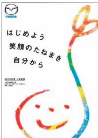
FY2008 human rights poster

The score on the yearly employee awareness survey is regarded as a key performance indicator (KPI) for the estimated results of such training and educational activities. If this score declines or fails to improve, activities are reviewed and measures to improve them considered.